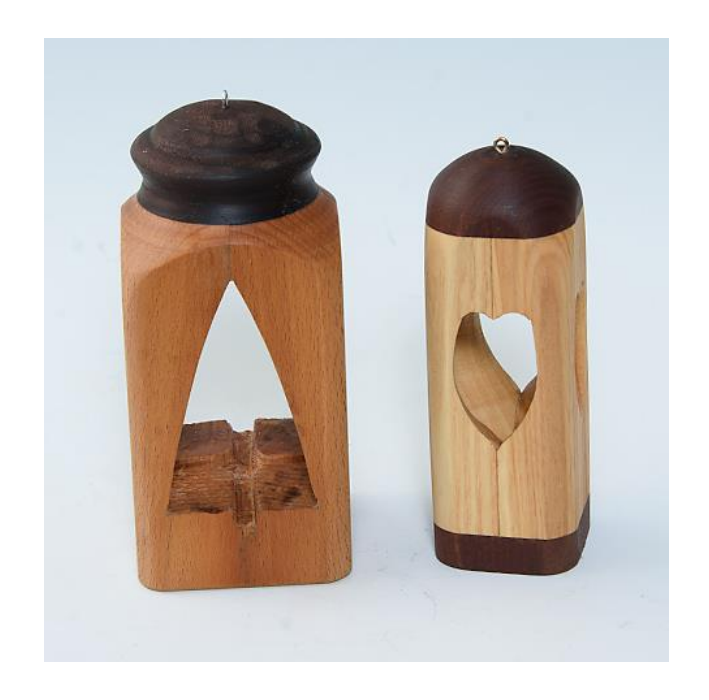
Tom Oehler-Maple & Walnut-Oil-POM