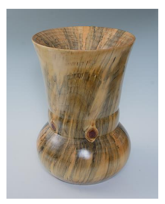
Don Potter-Norfolk Island Pine-S&T