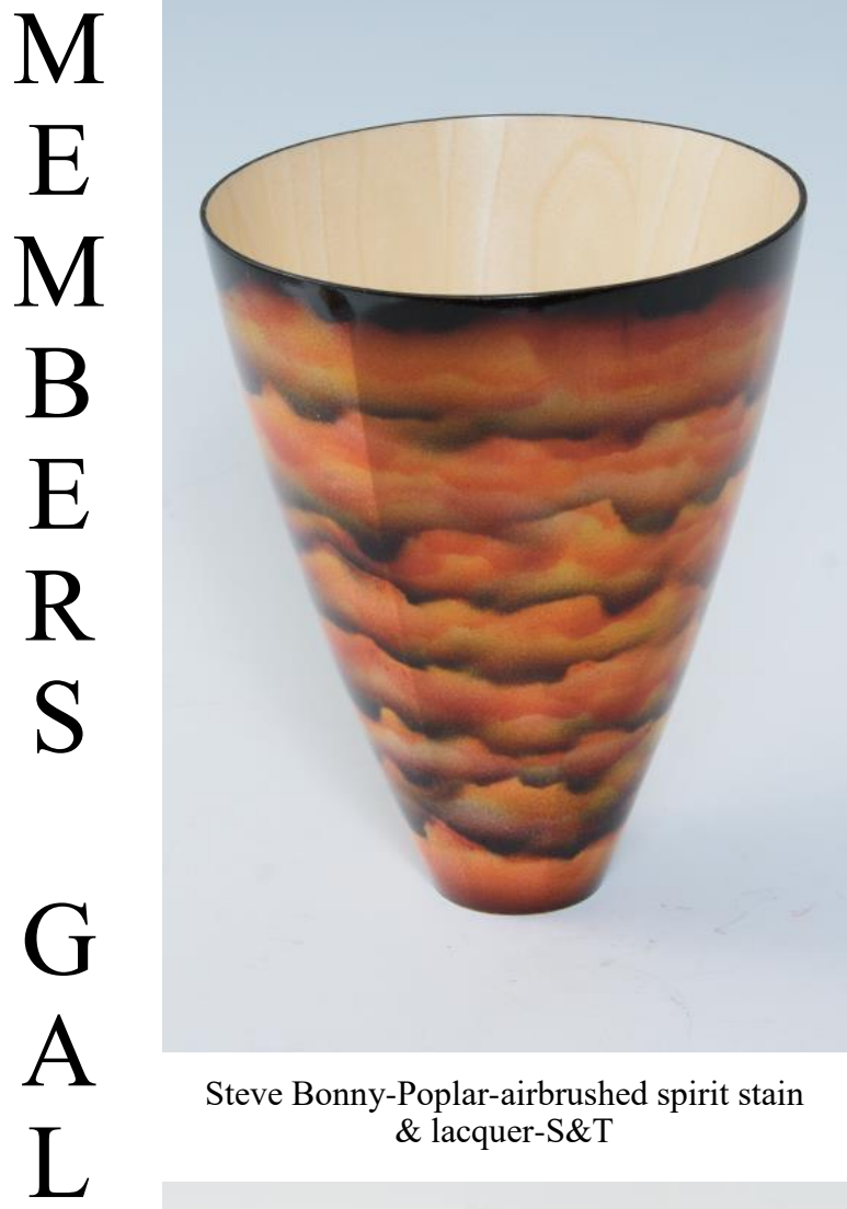
Steve Bonny-Poplar-airbrushed spirit stain & lacquer-S&T