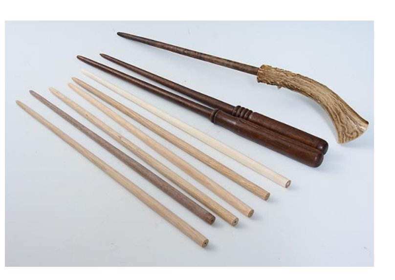
Bruce Kruse-Various-Walnut Danish Oil-SN&T