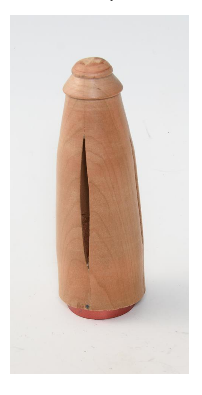
Don Coleman-Cherry-Water based poly-POM