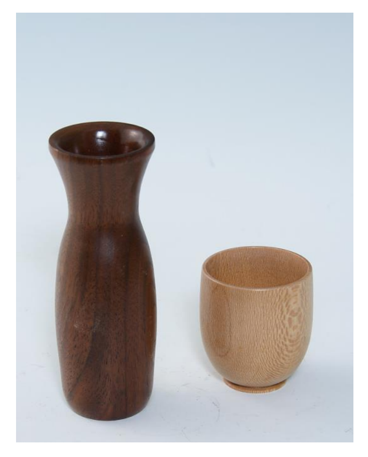
Tom Mills-Walnut & Sycamore-WOP-S&T