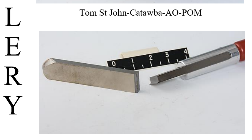
Jeremy Hanson-broken scraper

Name -Wood - Finish - Category WOP=Wipe on Poly POM=Project of the month S&T=show and tell Legend: AO=Antique Oil BLO= Boiled Linseed Oil SB= Salad Bowl finish FOG=Found on Ground